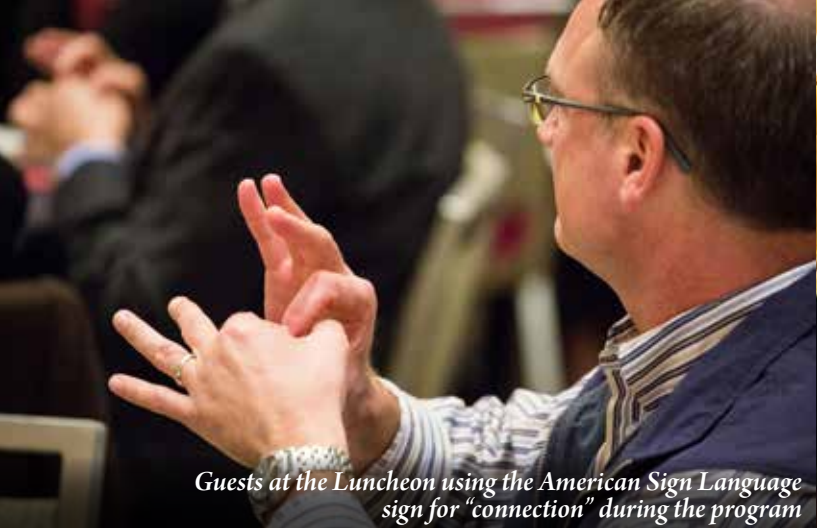
Guests at the Luncheon using the American Sign Language sign for "connection" during the program